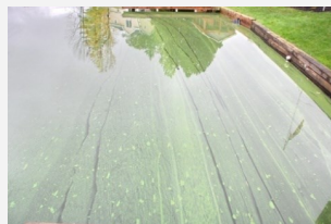
Parallel, usually green, streaks. Blooms often along shorelines.