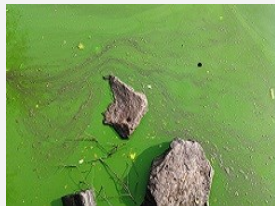
Bright green or like pea soup. Floating green dots or globs.