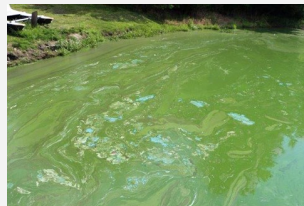
Blue, green, or white spilled paint.

Some green algae blooms can look like a HAB, but do not produce toxins. See examples below for what a non-toxic bloom might look like: