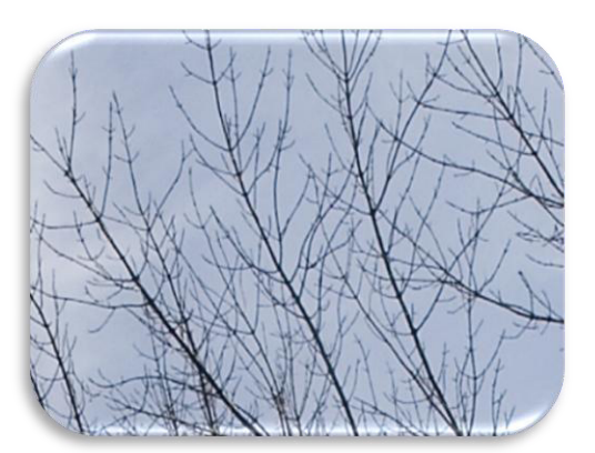
Opposite Branch Arrangements Buds, Leaves and Branches are directly across from one another