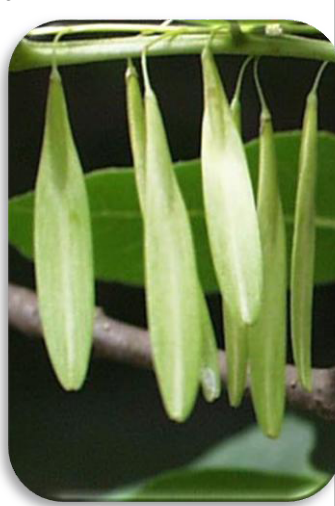
Single Samara Fruit Seed surrounded by a dry, oar shaped wing