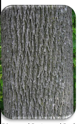
<u>Diamond Patterned Bark</u> Ridges and furrows form diamond shapes in older bark (green & white ash)