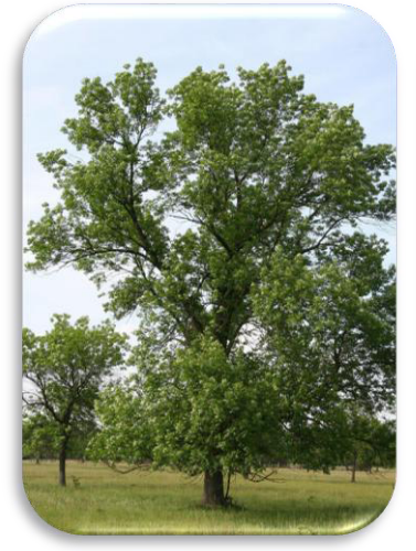
Trees have an Upright, Oval Shape