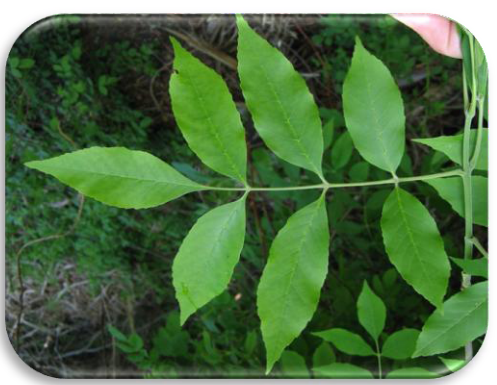
<u>Pinnately Compound Leaves</u> Leaf made of leaflets arranged in a line with one terminal leaflet. 5-11 leaflets per leaf